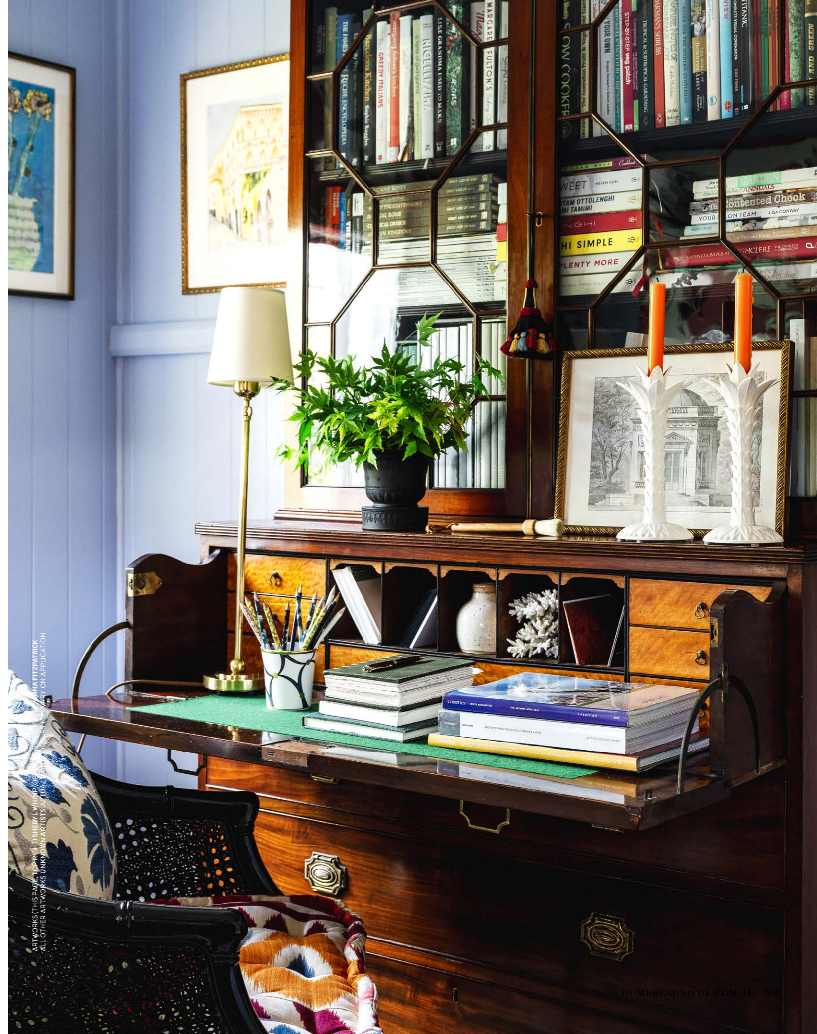
ARTWORKS (THIS PAGE, TOP RIGHT) SHERYL WHIMP CO. ALL OTHER ARTWORKS UNKNOWN ARTISTS AT THE TIME OF APPLICATION