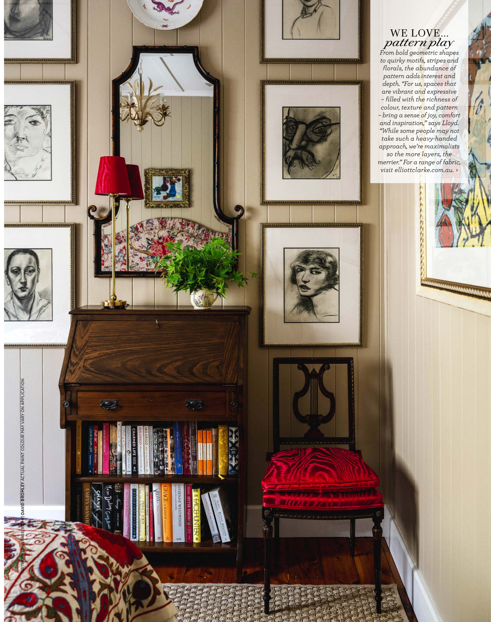
ARTWORK THIS PAGE RIGHT DAVID BROMLEY ACTUAL PAINT COLOUR MAY VARY ON APPLICATION

WE LOVE... pattern play From bold geometric shapes to quirky motifs, stripes and florals, the abundance of pattern adds interest and depth. "For us, spaces that are vibrant and expressive - filled with the richness of colour, texture and pattern - bring a sense of joy, comfort and inspiration," says Lloyd. "While some people may not take such a heavy-handed approach, we're maximalists so the more layers, the merrier." For a range of fabric, visit elliottclarke.com.au .