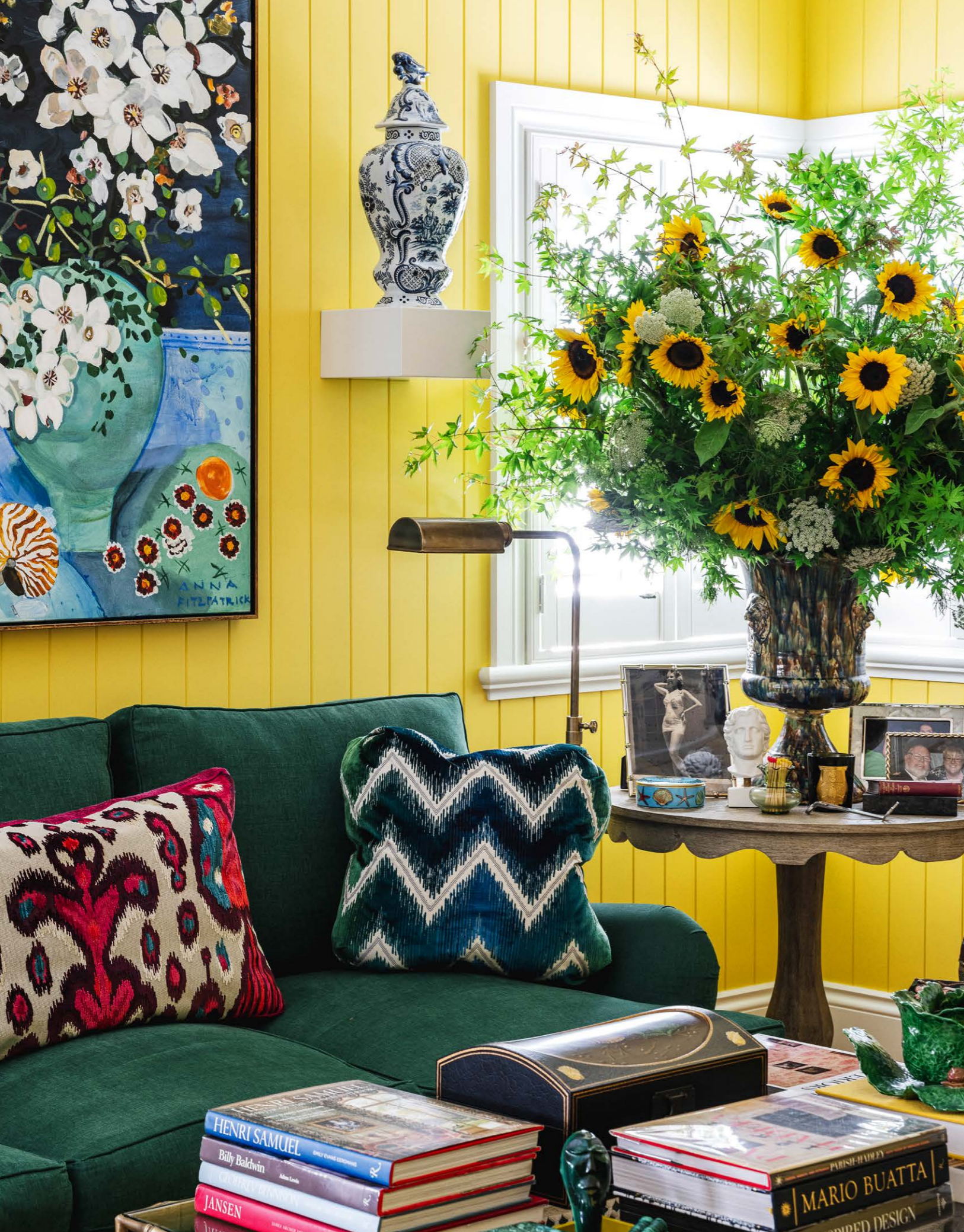
ACTUAL PAINT COLOUR MAY VARY ON APPLICATION